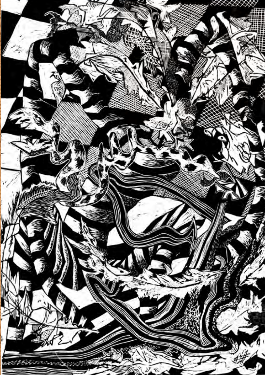
100 x 70 cm. Woodcut Chamán