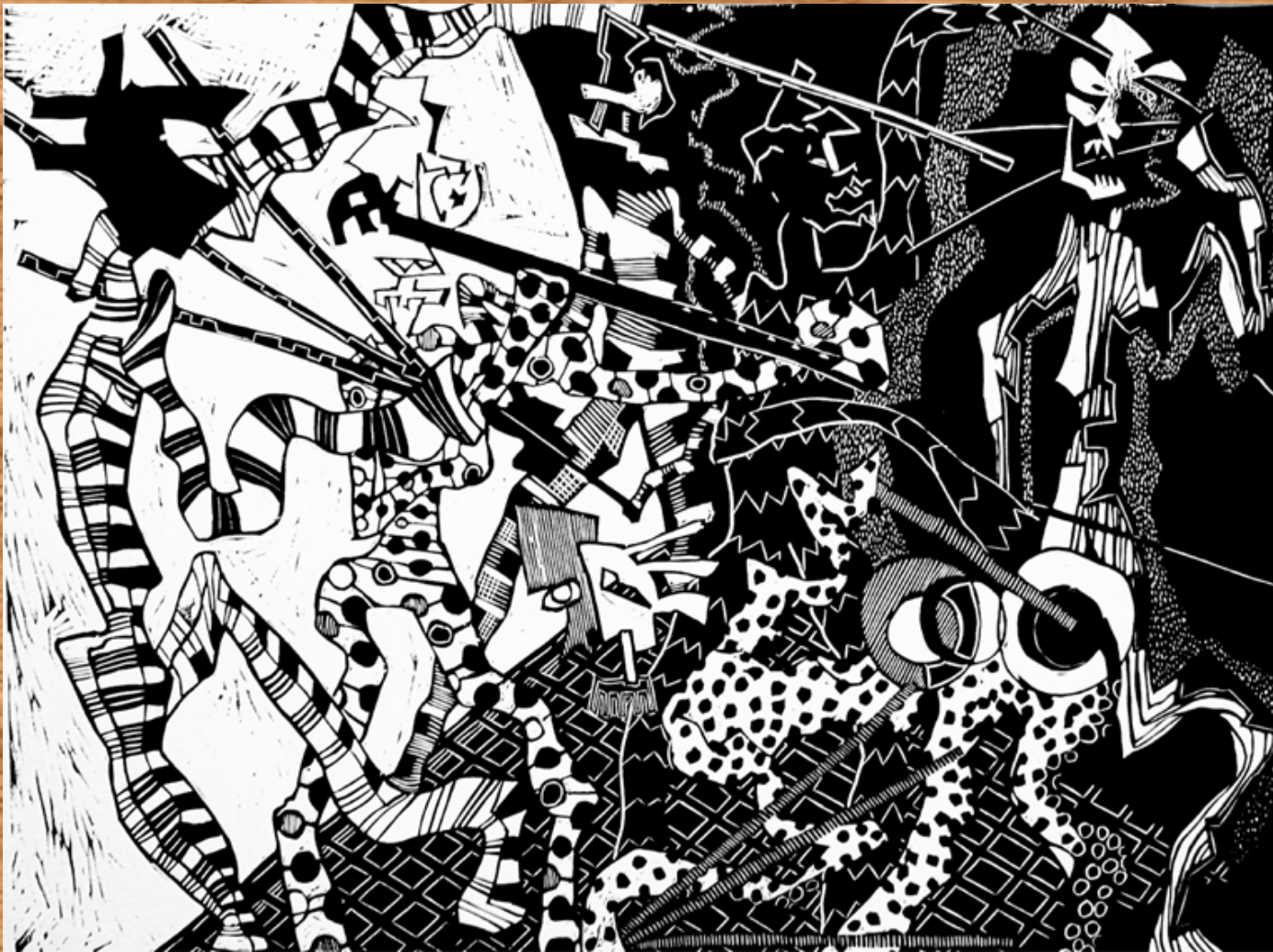
100 x 70 cm. Woodcut Musicians