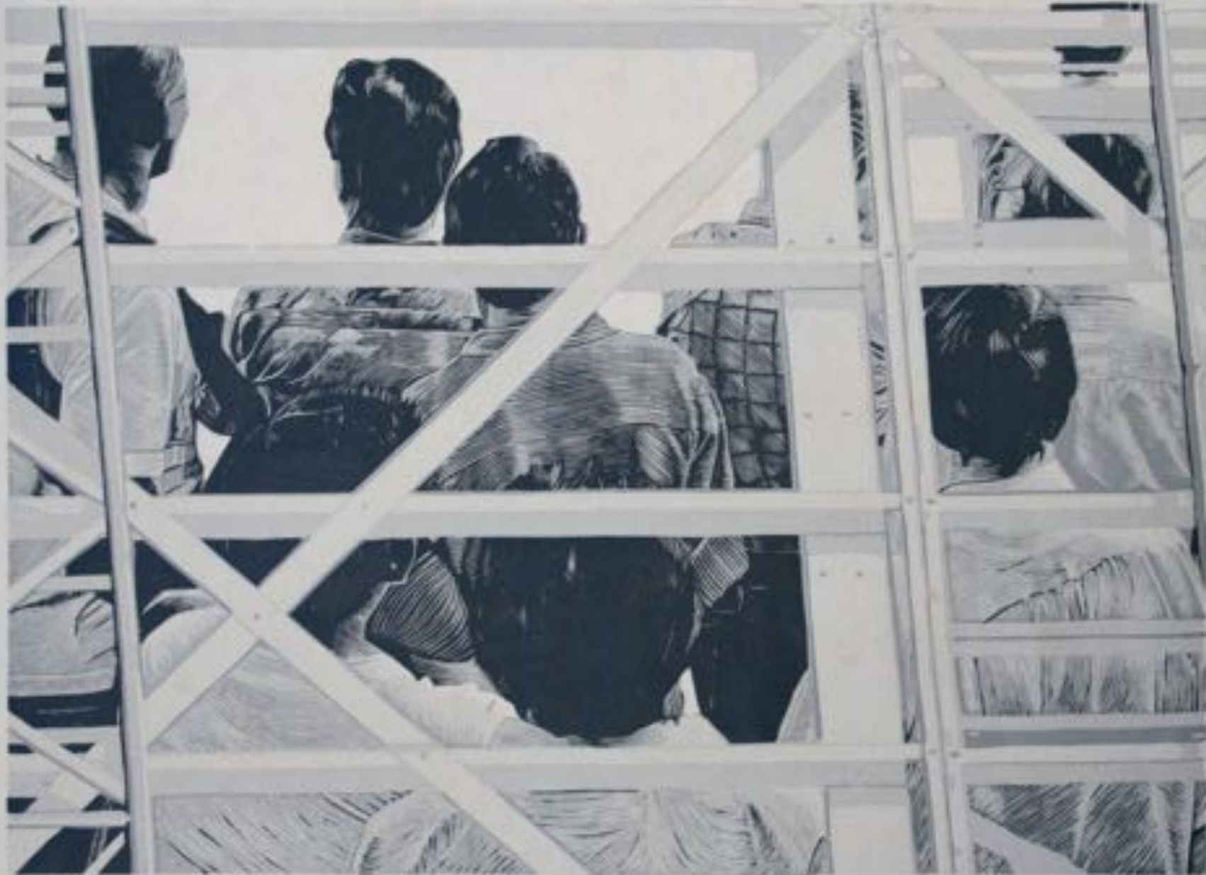
Image 4. Muhammet Fatih Gok, Crowded II , 2017, Woodcut, 60cm x 84cm