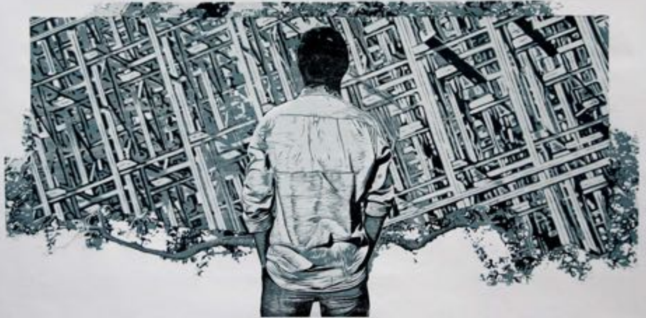
Image 3. Muhammet Fatih Gok, The Man Who Wasn't There , 2016, Woodcut, 62.5cm x 125cm