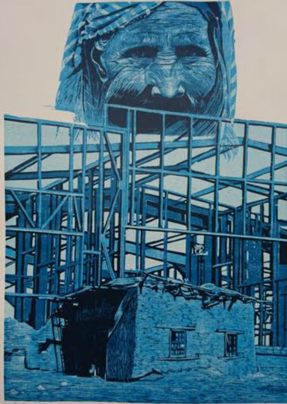
Image 1. Muhammet Fatih Gok, Modern Times , 2015, Woodcut, 84cm x 60cm